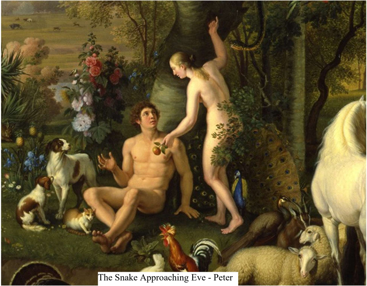
The Snake Approaching Eve - Peter